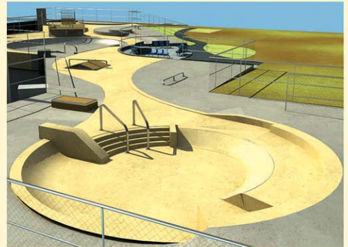
*Landscape Architectural Services, Design of Skate Park & Playground at Golconda Skate Park, for NYS Department of Transportation, Brooklyn, NY

A s an award-winning engineering firm, KSE understands how the natural environment impacts the built environment. It is not enough for a landscape to be merely beautiful. It must also serve the needs of its users and be sustainable for years to come. KSE has the expertise to design landscapes that compliment our civil engineering services and seamlessly integrate with our existing site engineering, traffic, transportation, roadway and bridge design services. KSE 's Landscape Architecture Department has the knowledge, skill and experience to provide a wide range of landscape design services to clients in both the public and private sectors. Our team is experienced in site selection and planning, devising site designs, planting plans, grading, layout, material selection and coordination with regulatory agencies throughout the Tri-State area.