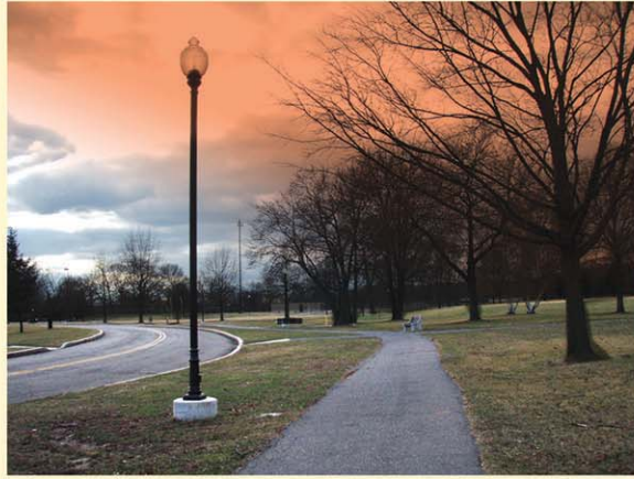
Landscape Architecture and Path Replacement for Thomas A. Edison County Park, County of Middlesex, NJ