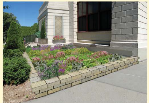
*Landscape Architectural Services, Green Roof Garden, Parking Lot and Entrance Design for Riverview Condominium, Tuckahoe, NY