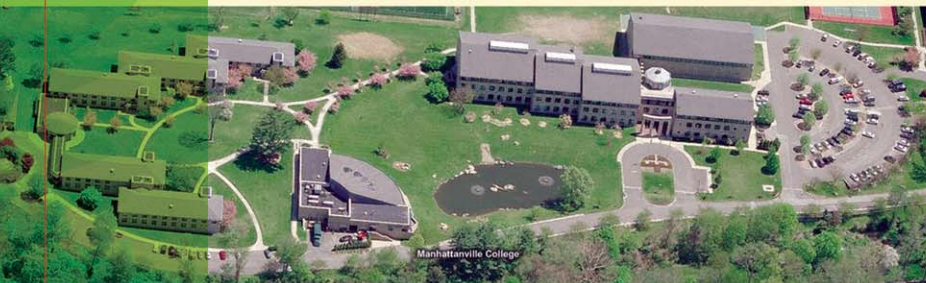
*Landscape Architectural Services, Site Lighting and Planting Design for Keio Academy of New York, Purchase, NY