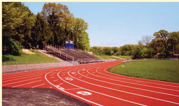
*Design of Track & Field Event Items for Ramapo & Indian Hills High School, Franklin Lakes & Oakland, NJ