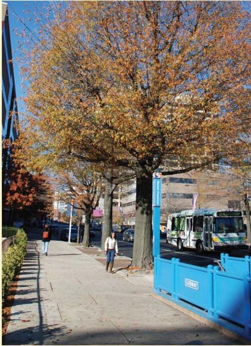
Market Street Streetscape - Final Planting Plans for University City District, Philadelphia, PA