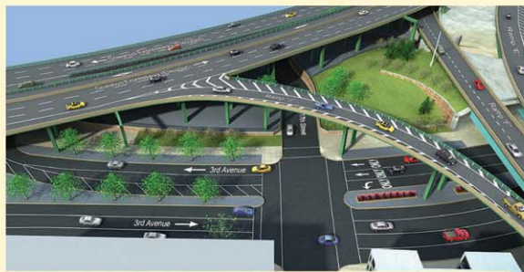
*Landscape & Streetscape for the Gowanus-Prospect Interchange Parkland, NYS Department of Transportation, Brooklyn, NY