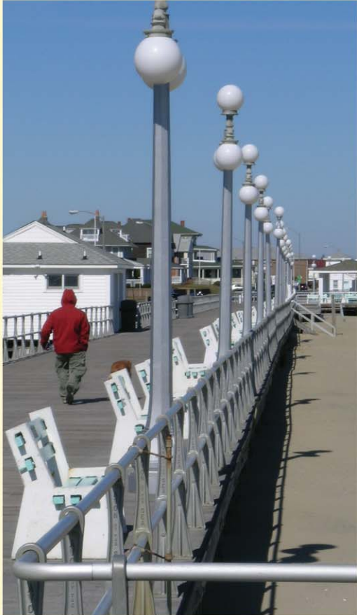
*Avon-by-the-Sea Boardwalk Reconstruction, Avon, NJ