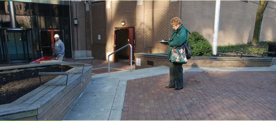
Market Street Streetscape - Entrance Landscape and Paving Design for The Science Center University District- Philadelphia, PA